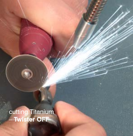
cutting Titanium – Twister OFF