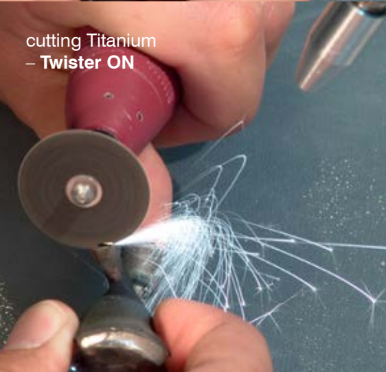
cutting Titanium – Twister ON