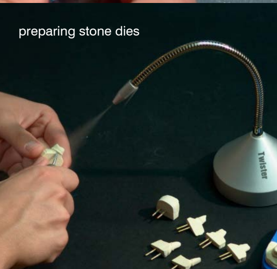
preparing stone dies