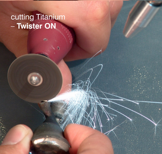
cutting Titanium - Twister ON