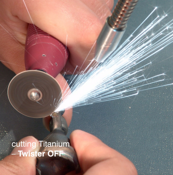
cutting Titanium - Twister OFF