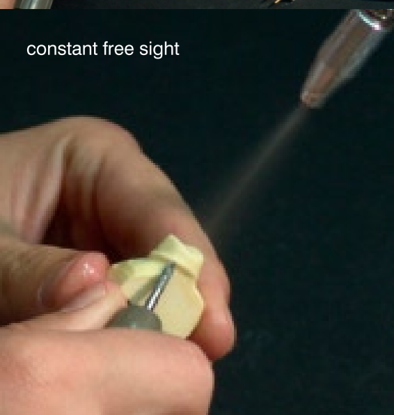
constant free sight