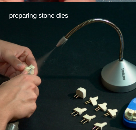
preparing stone dies